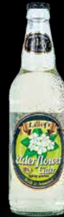
Elderflower 3.4% - Sparkling