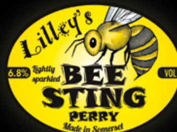
Bee Sting Perry 6.8%

A full bodied, cloudy traditional cider. It has a golden rustic appearance and is packed full of character and flavour. Medium dry and lightly sparkled.