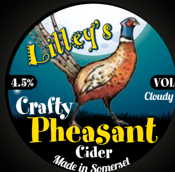
Crafty Pheasant 4.5%

This strong rustic cider with its Roman flair has everything. Well rounded, fruity, packed full of flavour and intoxicatingly easy to drink for an 8.4% cider. Medium.