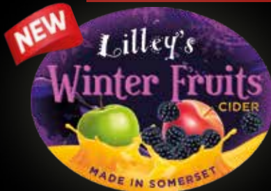
Winter Fruits 3.4%

This is a crisp refreshing cider with a glorious appley taste. It is a medium cider with it's own unique character. Lightly sparkled.