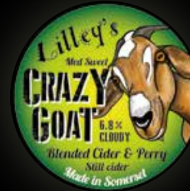
Crazy Goat 6.8%

Sweet but incredibly refreshing with a glorious fresh tasting pear flavour and a wonderful pear aroma.