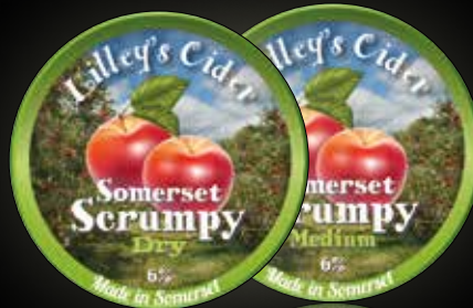
Somerset Scruppy Medium 6%

A traditional still cloudy cider with a rich rosy colour. This medium cider has been packed full of delicious apples creating an intense and juicy apple flavour.