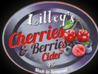
Cherries & Berries 4%

An explosion of tropical fruits. Pink grapefruit, pineapple, mango & lime all combine to make this a succulent thirst quencher. Lightly sparkled.