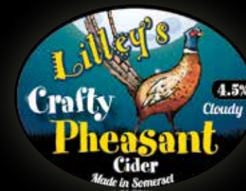
Crafty Pheasant 4.5%

This strong rustic cider with its Roman flair has everything. Well rounded, fruity, packed full of flavour and intoxicatingly easy to drink for an 8.4% cider.