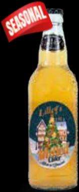
Mulled Cider 4% - Still