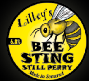
Bee Sting Still 6.8%

Refined from 88% pear and 12% apple this elegant drink is sweet in flavour with a melt in the mouth exotic taste and soft champagne colour.