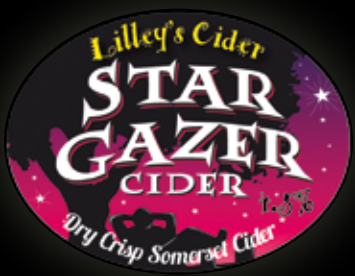
Star Gazer 4.5%

Indulge in the delightful flavours of Winter Fruits Cider, with the perfect combination of apple and blackberry, this smooth and fruity drink is a pure delight.