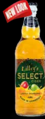
Select 4.8% - Sparkling