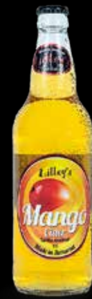
Mango 4% - Sparkling