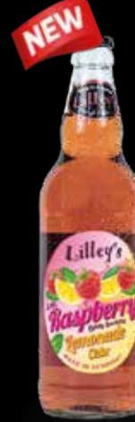
Raspberry Lemonade 3.4% - Sparkling