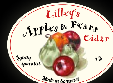
Apples & Pears 4%

Award winning sparkling medium sweet perry that has a cult status among many of its devotees. Oozing with striking flavours and with a subtle pear aroma. Lightly sparkled.