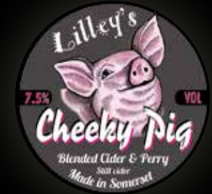
Cheeky Pig 7.5%

A medium sweet mix of a cider and perry, hazy yellow/golden cloudy cider. This has been expertly blended to give a mouth watering, juicy flavour and deceptive in it's taste for the strength.