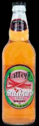
Rhubarb 4% - Sparkling