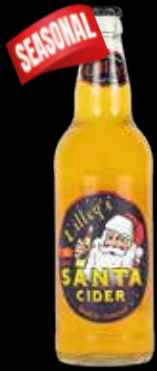
Santa Cider 6% - Still