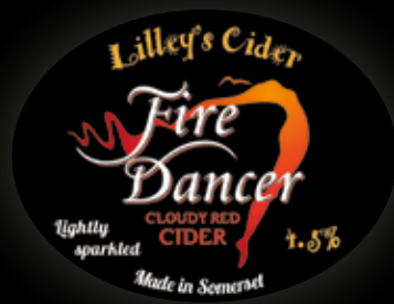
Fire Dancer 4.5%

Slowly matured dry cider made from a blend of apples making a smooth and refreshing cider. Lightly sparkled.