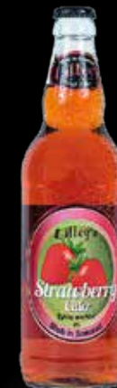
Strawberry 4% - Sparkling