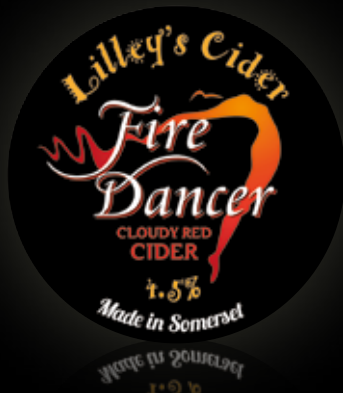
Fire Dancer 4.5%

A medium dry blend of perry and cider that is golden amber in colour. Made using our crisp Somerset apple cider and our fresh tasting perry, resulting in a refreshing drink which is packed full of flavour with a fairly dry texture.