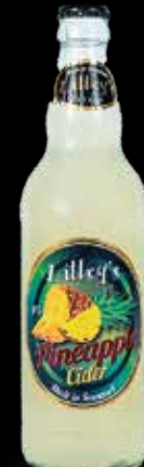
Pineapple 3.4% - Sparkling