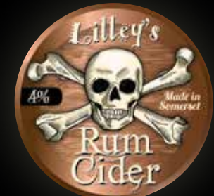
Rum Cider 4%

This is a fantastic collision between our crisp Somerset cider and our very own premium cola. It's smooth and very refreshing with hints of caramel complementing it's well balanced flavour. Contains caffeine.