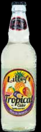
Tropical 4% - Sparkling