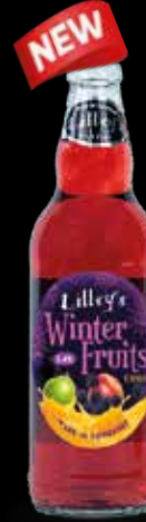
Winter Fruits 3.4% - Sparkling