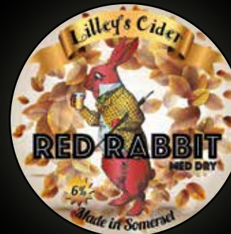
Red Rabbit 6%

This mysterious cider has a completely unique character. Dark in colour it has woody and caramel notes and has been carefully crafted to appeal more to ale drinkers than our other ciders. Medium.